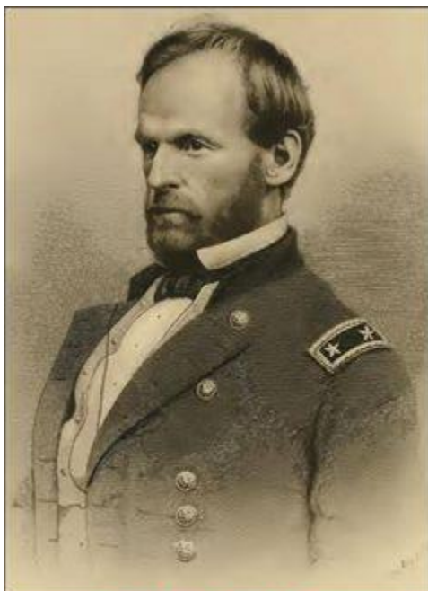
Major General, Union Army